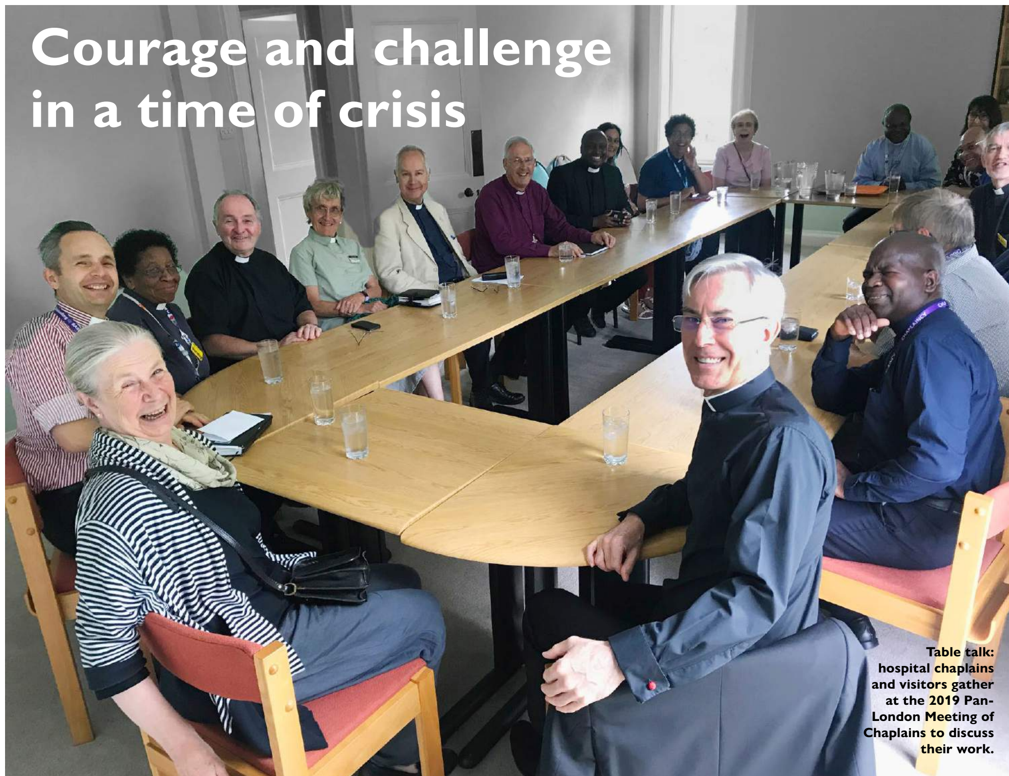
Table talk: hospital chaplains and visitors gather at the 2019 Pan- London Meeting of Chaplains to discuss their work.